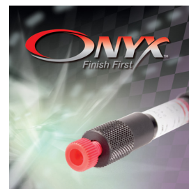
Products used in this application: