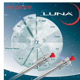
Products used in this application:

Detection: UV-Vis Abs.-Variable Wave.(UV) @ 285 nm (25 °C)